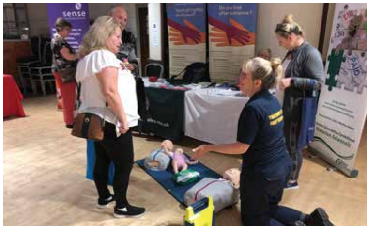
Learning about CPR with the Welsh Ambulance Trust, Carers' Week Information Day

We had a VERY full week of events, learning opportunities and activities. We are hoping for the same sort of things next year but if there is something you feel was missing or something you'd particularly like us to include, please let us know.