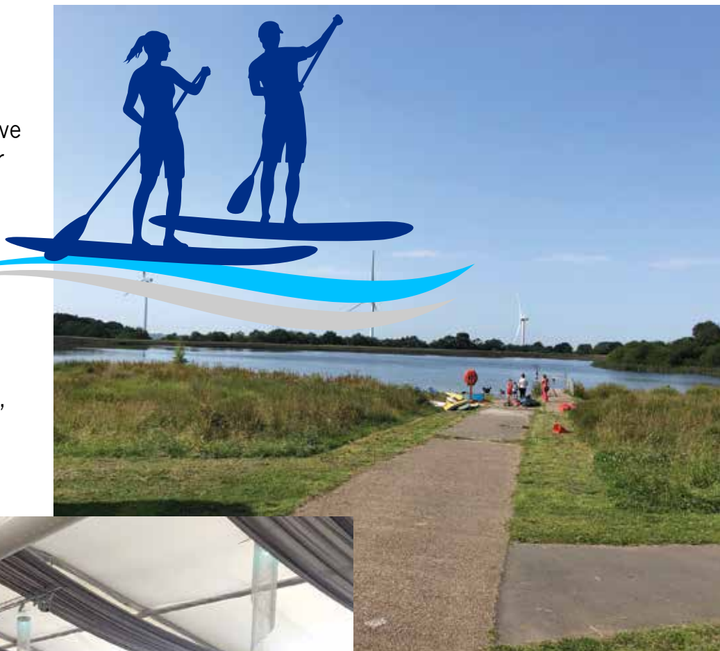
Paddleboarding and water activities at Pen-y-Fan Pond

Celebrations aside, this group has really grown and it is wonderful to see the sharing of friendships, advice, support and information, so well done you lot!