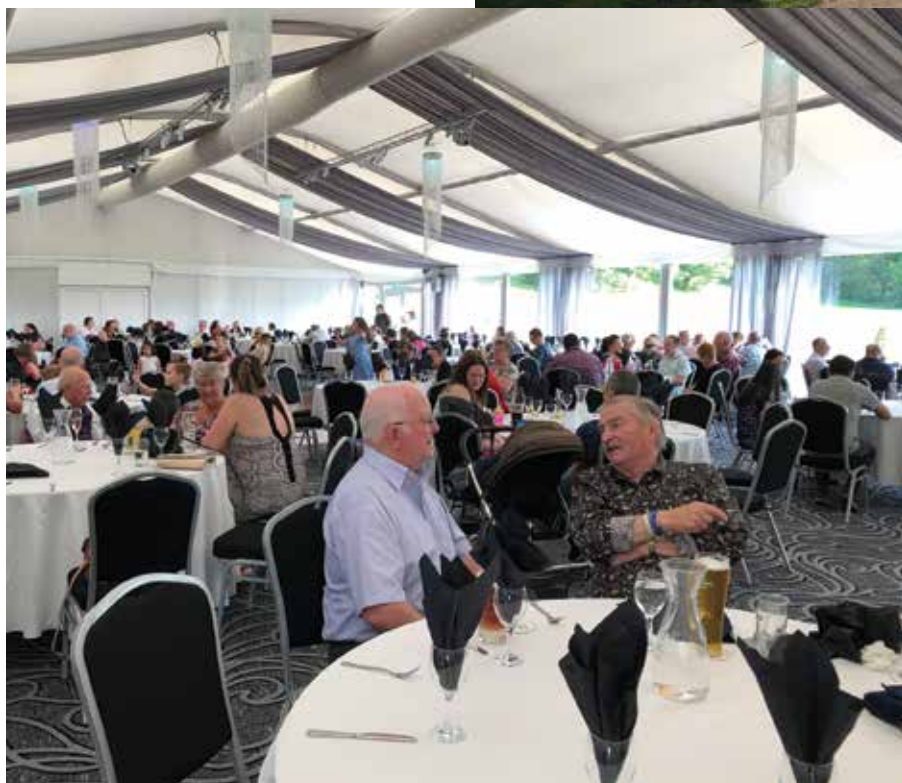
Summer party at Bryn Meadows Golf & Spa

In the coming three months, we have organised some new things we hope you will like, as well as putting on some training that we hope you will find useful. Eventually, we hope to have a rolling programme of training courses and practical sessions for you to attend, so we need your ideas to make this as successful, useful and diverse as possible.