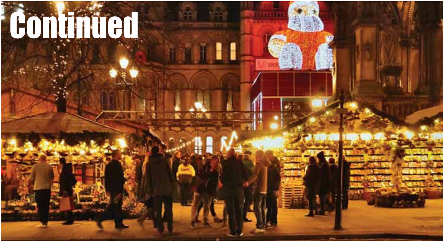
Swansea Christmas Market

Thursday 7th November 2019 - Cinema night at Maxime Cinema, Blackwood. We'll be at the cinema so you can just come along and pick your own film. Let us know if you'd like to come and we can let you know more information like times and films closer to the date.