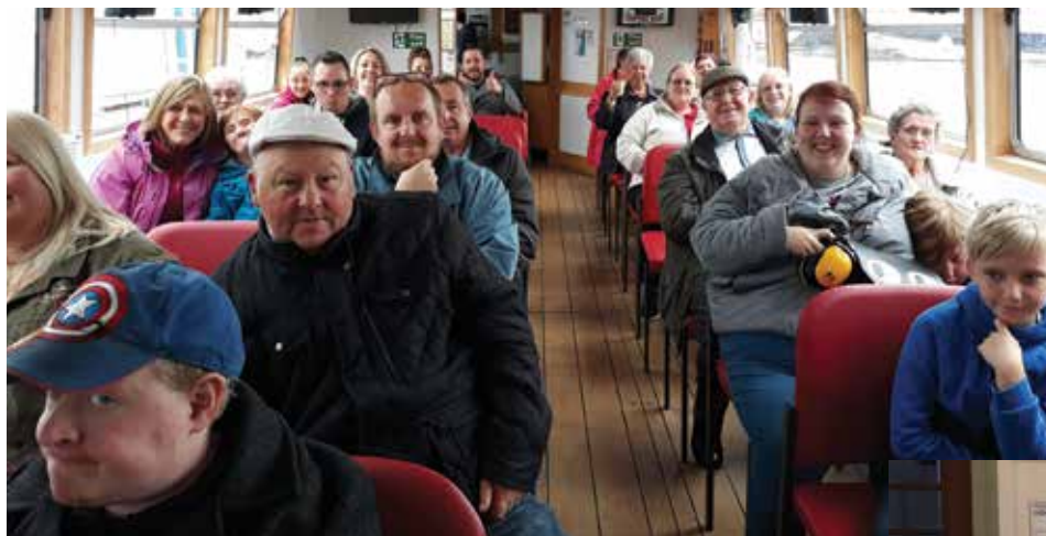
River Tawe Cruise on the Copper Jack in Swansea, Carers Week

We had a VERY full week of events, learning opportunities and activities. We are hoping for the same sort of things next year but if there is something you feel was missing or something you'd particularly like us to include, please let us know.