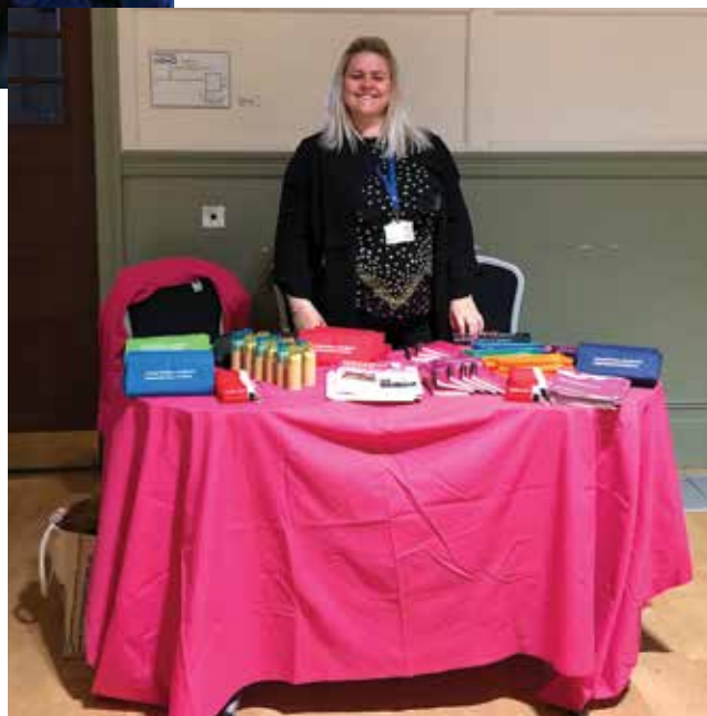
Carers Team stand at the Information Day